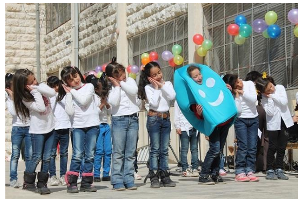
<u>Above</u>: Children dancing and learning about the importance of water

In 1992, the UN General Assembly declared March 22 as World Water Day, which is a day to celebrate the importance of water. Jordan, already being the fourth most water deprived country, received very little precipitation this year during its rainy season. Water is normally supplied through water tanks, which are placed on rooftops of buildings. The tanks are then filled by public water delivery several times a week.