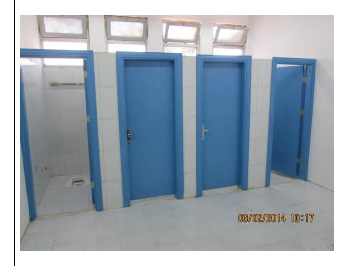
<u>Above</u>: Storage room was converted into new latrines at a Jordanian public school

JEN has decided to renovate an additional fifty schools and has started building new classrooms to accommodate for the increasing number of students.