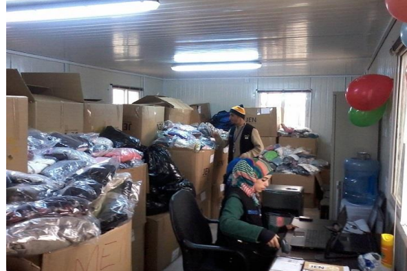
Above: JEN staff personalizing clothing packages

Personalization of each family package is done on site in the distribution caravan, which is open twenty-four-seven and is run by seven JEN staff members. During JEN's first three days of distribution, over eight hundred individuals were handed new, warm clothes. Thanks to the warehouse team, who organized and repacked donated clothes, over forty thousand individual sets of clothing have been distributed since January, 2014.